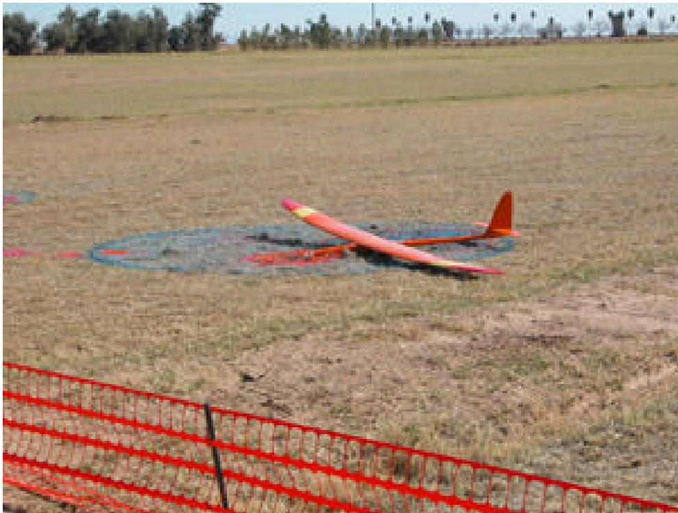
Doc was landing the ICON real well too...