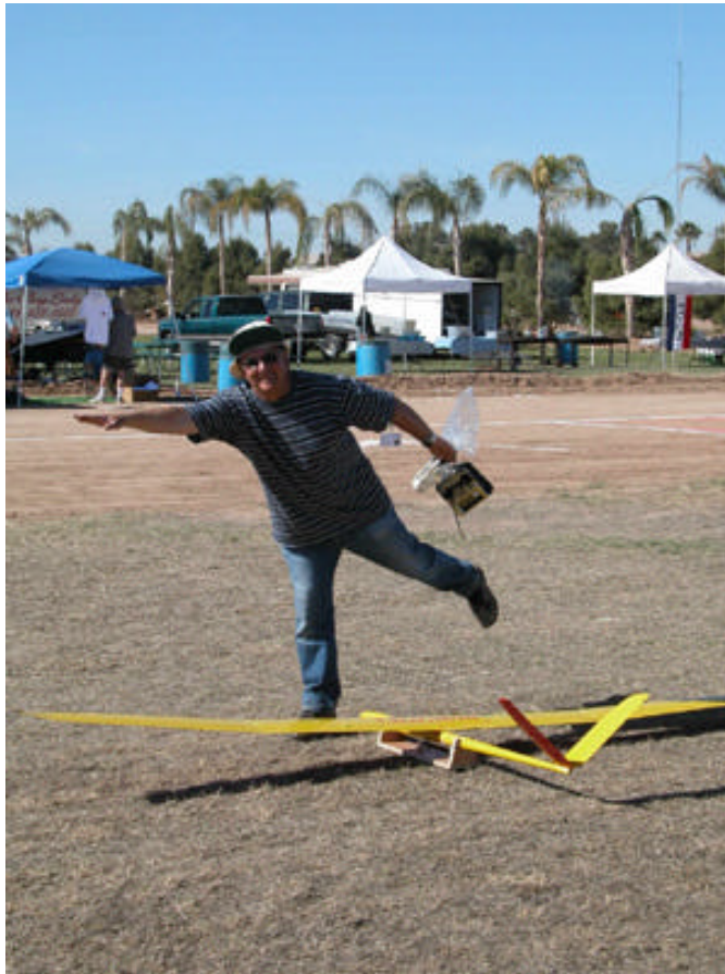
Don was ready to rock!