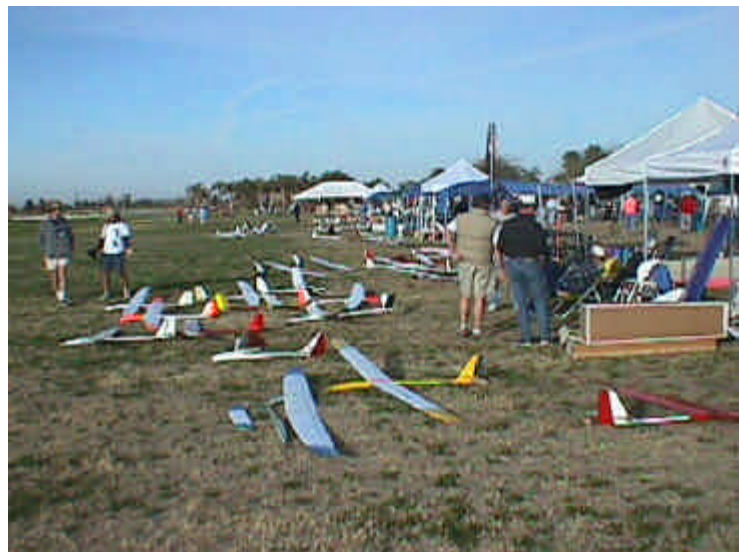
The Flight Line